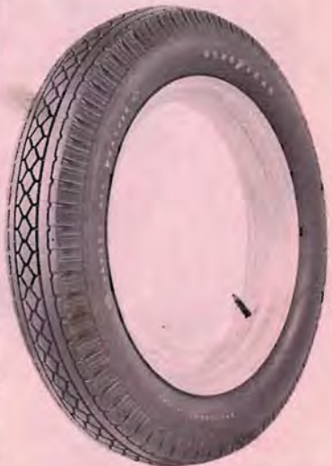
SAFETY ALL-WEATHER ANTIQUE