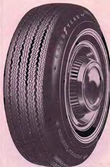
3T NYLON CUSTOM POWER CUSHION TRIPLE WHITE