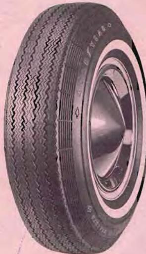
3T NYLON SAFETY ALL-WEATHER "8"