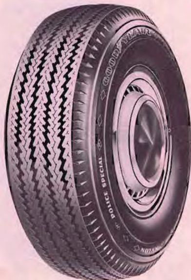
3T NYLON POLICE SPECIAL