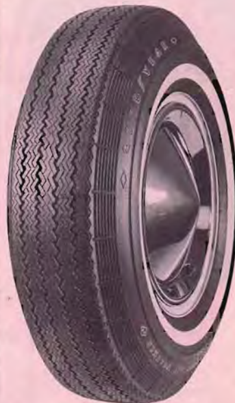
3T NYLON SAFETY All-Weather "8" NW TUBELESS