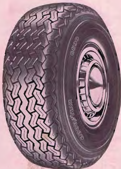
3T RAYON G-800 RADIAL PLY TUBE-TYPE