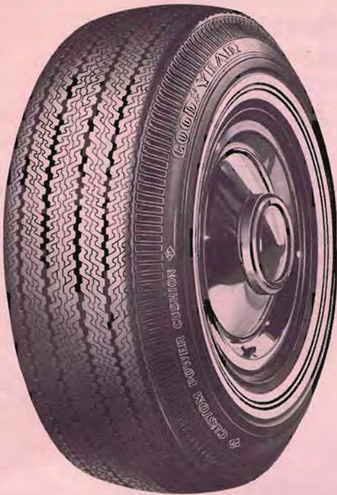
3T NYLON CUSTOM POWER CUSHION