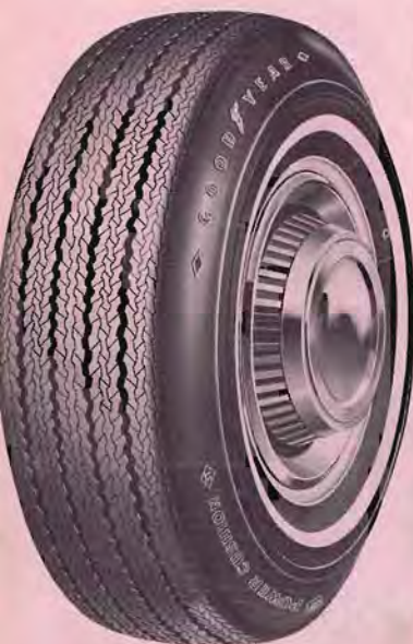
3T RAYON POWER CUSHION EXTRA NARROW WALL