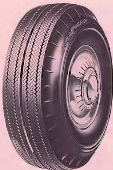
NYLON SPECIAL TRAILER SERVICE