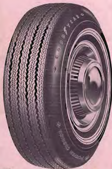
3T RAYON POWER CUSHION TRIPLE WHITE RIVIERA TIRE