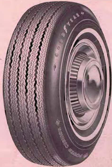
3T RAYON POWER CUSHION