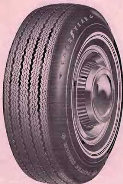
3T RAYON POWER CUSHION TRIPLE WHITE IMPERIAL TIRE

NO LIMIT ROAD HAZARD AND QUALITY GUARANTEE