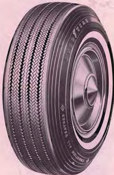
3T NYLON TRACTION ALL-WEATHER NW TUBELESS

★—The Dept. Number (example 106, 114, etc.) must always precede other numbers when ordering by product code.