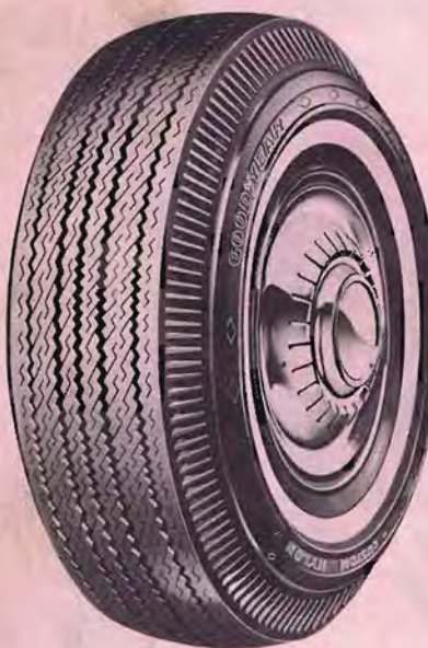
3T NYLON CUSTOM SUPER CUSHION (BLUE CIRCLE SAFETY TIRE) NARROW WALL