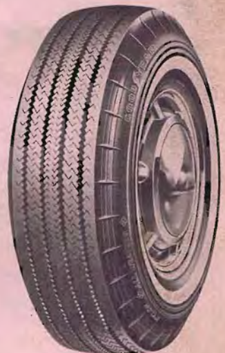
3T NYLON ALL-WEATHER

THE GOODYEAR TIRE & RUBBER COMPANY, AKRON, OHIO 44316