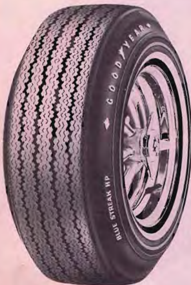
3T NYLON BLUE STREAK HP