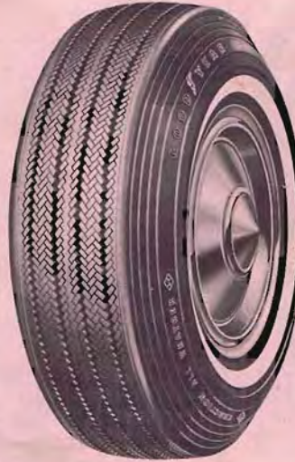
3T NYLON TRACTION ALL-WEATHER