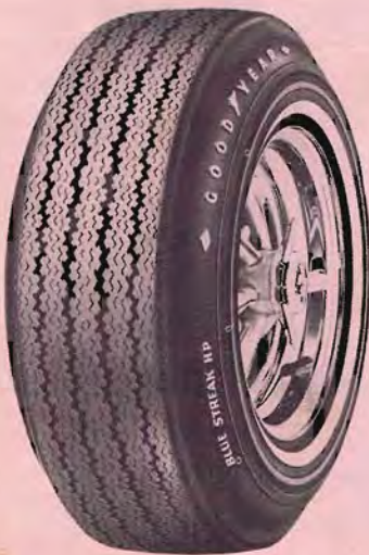
3T NYLON BLUE STREAK HP